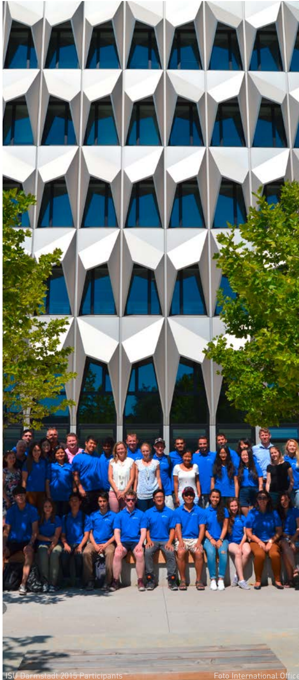
ISU Darmstadt 2015 Participants