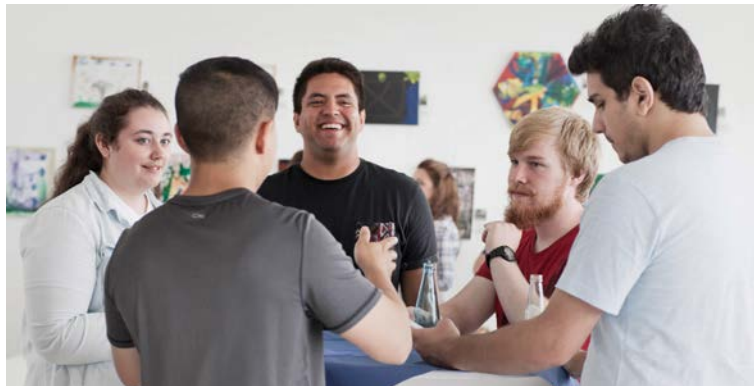
ISU 2016 Participants at opening event