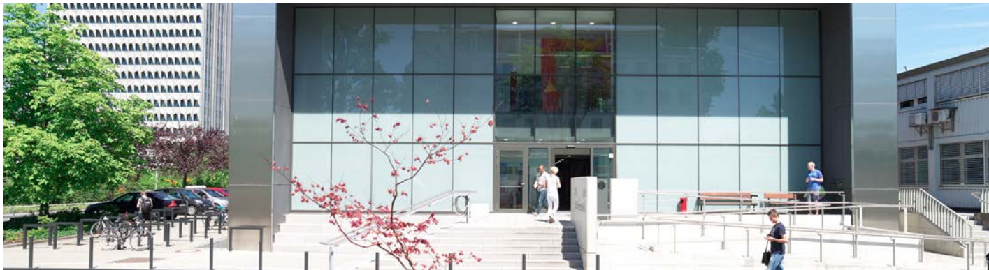
Library, D10/Schöfferstraße 8