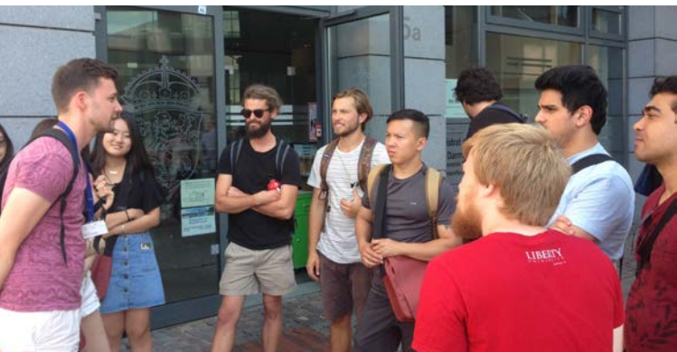
ISU 2016 Participants at Darmstadt City Tour