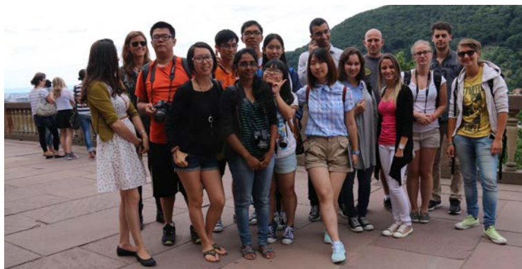
ISU 2014 Participants visiting Heidelberg