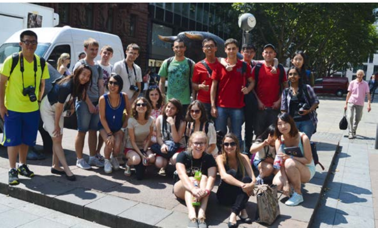
ISU 2014 Participants