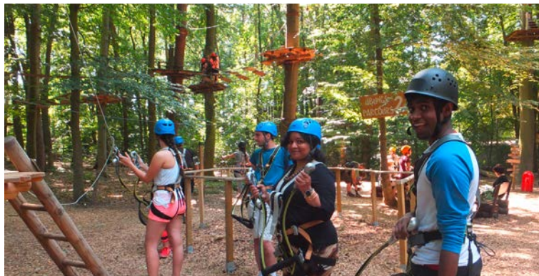
ISU 2015 Participants at Climbing Park